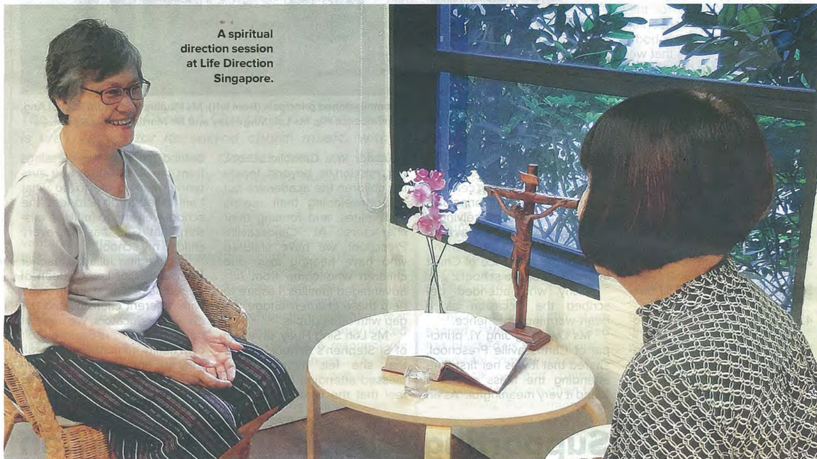
A spiritual direction session at Life Direction Singapore.